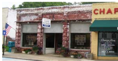
Historic Main Street Office